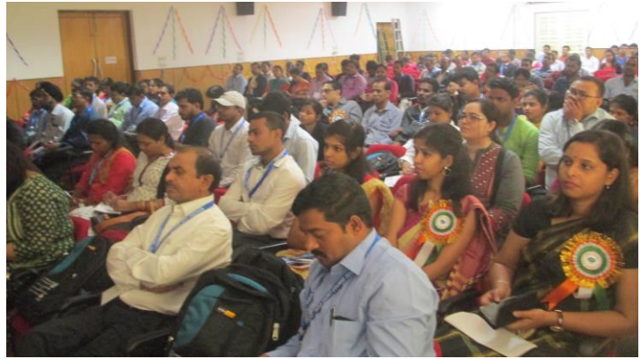
Participants in the Short Course