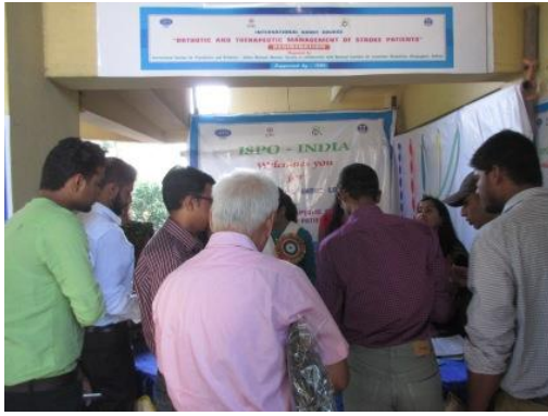
Registration for the Short Course